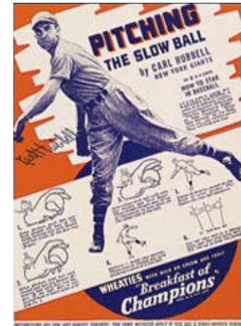
Carl Hubbell: 1938 Baseball

Wheaties broadcasts also led to the film career of Ronald “Dutch” Reagan, a sportscaster from Des Moines, Iowa, who made play-by-play re-creations of Chicago Cubs games using telegraph reports. In 1937, Reagan was voted the most popular Wheaties announcer in the country and was awarded a trip to the Cubs’ spring training camp in California. While there, he took a Warner Brothers screen test and subsequently became a popular film star. He later went into politics and became the 40th president of the United States.