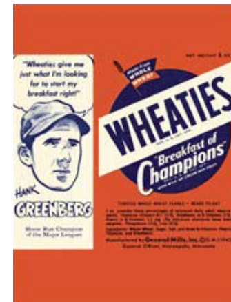
Hank Greenberg: 1947 Baseball

Finally, on the basis of consumer research and marketing statistics, the company made a crucial decision: abandon sports and go after the children's cereal market—a heavy per capita consumption group. In place of athletes, Wheaties began associating itself with the Lone Ranger and the Mickey Mouse Club. More youngsters began eating Wheaties, but not enough to offset the decline in adult consumption. Sales dropped more than 10 percent in one year.