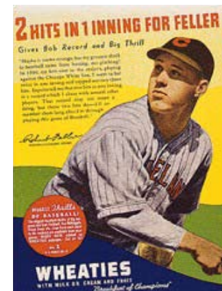
Bob Feller: 1938 Baseball

An unsolicited testimonial came in 1950 when a 22-year-old man from Trenton, N.J., hoisted a 2,700-pound elephant and its trainer on his back while 3,000 people watched. According to The Modern Millwheel , a General Mills employee publication, he was not paid for his statement that "I guess there's only one thing I eat every day-Wheaties."