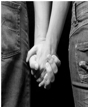
Union Hand in Hand

Sisters of Alpha Phi strive for good scholarship, moral character, and genuine culture. The colors